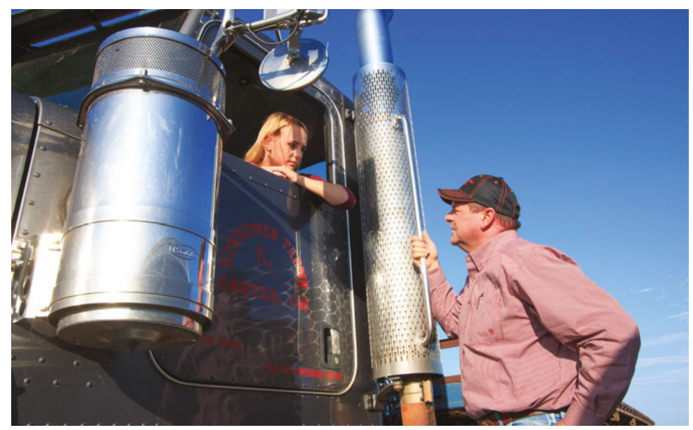
Under the ELD mandate, farmers and ranchers who haul livestock and other agricultural commodities could be subject to a problematic hours of service requirement.

Drivers who have to use ELDs would be limited to current hours of service rules, which restrict a driver to only 14 "on duty" hours, with no more than 11 active driving