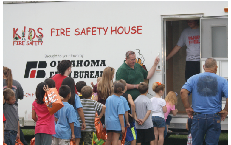
Children prepare to tour the OFB fire safety trailer during the Adair County safety fair. The OFB Safety Services Division uses the trailer to educate students about home evacuation, smoke detectors and what to do in case of a fire.

The Adair County Farm Bureau Women's Committee and YF&R provided snow cones for each student, and Stilwell High School Student Council and Service Club members were also on hand to keep the flow of children progressing and help as needed.