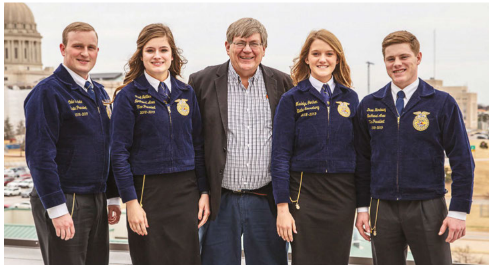
Four members of the 2018-2019 Oklahoma State FFA officer team visited Oklahoma Farm Bureau on March 7 where they had the opportunity to learn what opportunities are available through Farm Bureau and how they can become involved. OKFB is proud to support these bright students who will lead our industry both now and in the future.