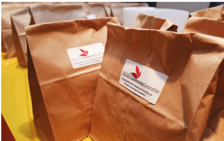
Above: To make this event possible, County Women's Leadership Committee members from across the state sent in donations.