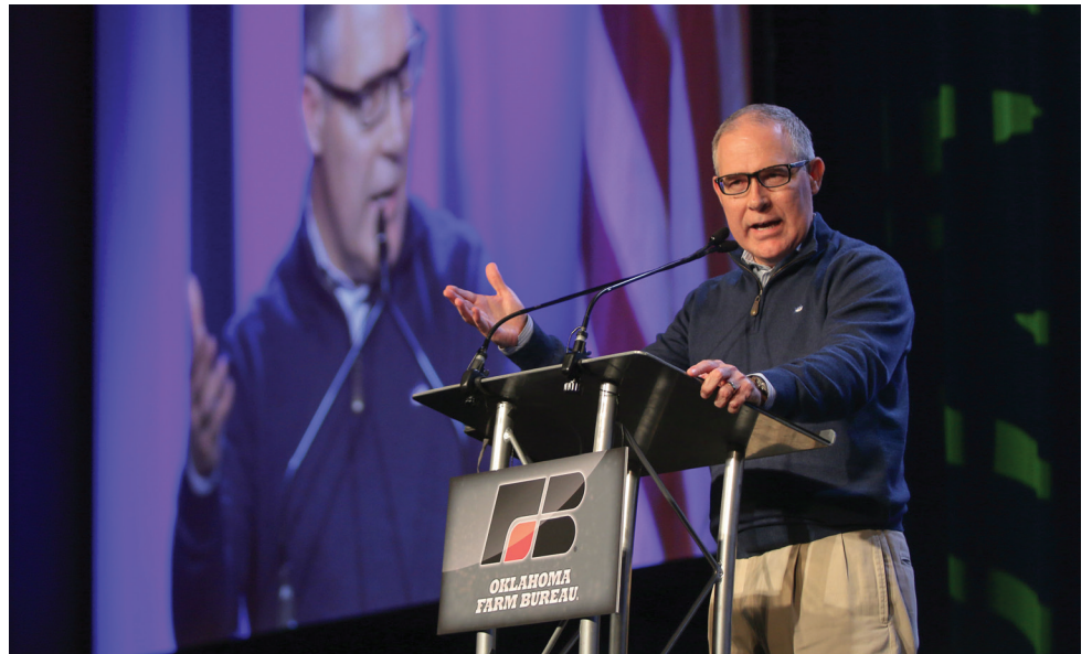
Oklahoma Attorney General Scott Pruitt speaks to Oklahoma Farm Bureau members during the opening session of the 2016 OKFB Annual Meeting Nov. 11, 2016, in Oklahoma City.

“There’s not a clear and present threat that I know of today, I think this was just simply, ‘We want to protect ourselves into the future,’” Pruitt said. “I think we just have to be vigilant in watching to make sure that those folks don’t come in and try to achieve that.”