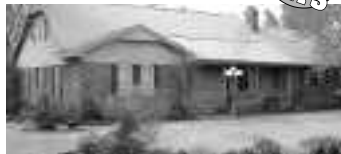
(BOCA & IBC Approved)