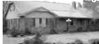
(BOCA & IBC Approved)