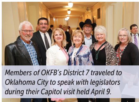
Members of OKFB's District 7 traveled to Oklahoma City to speak with legislators during their Capitol visit held April 9.