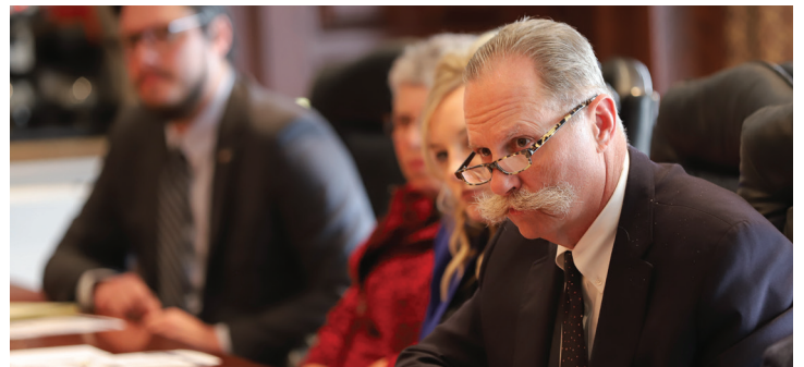
In addition to OKFB, all Oklahoma Congressional offices, the Oklahoma Department of Commerce and the Oklahoma Department of Agriculture, Food & Forestry were represented.