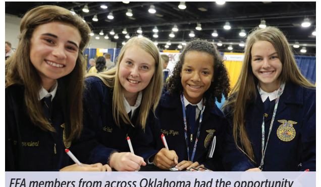
FFA members from across Oklahoma had the opportunity to stop by the OKFB booth and learn about youth programs available to them through YF&R.