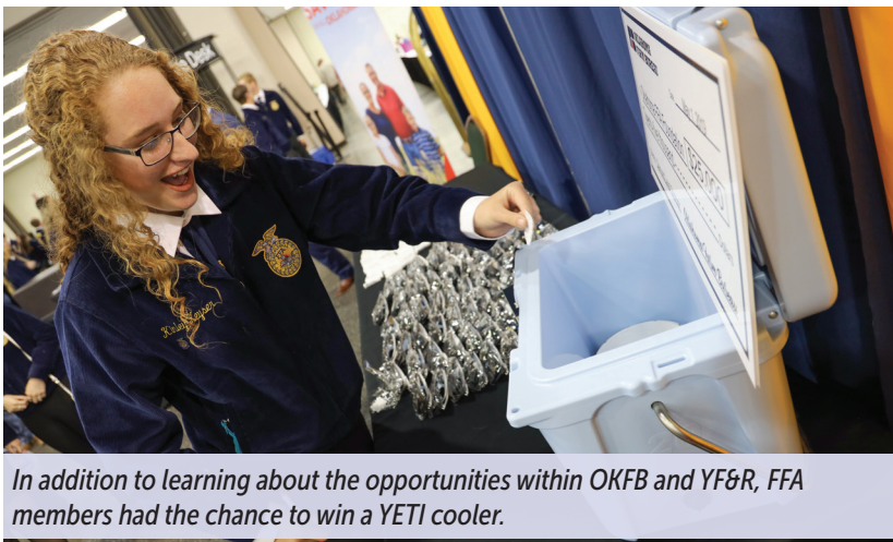
In addition to learning about the opportunities within OKFB and YF&R, FFA members had the chance to win a YETI cooler.