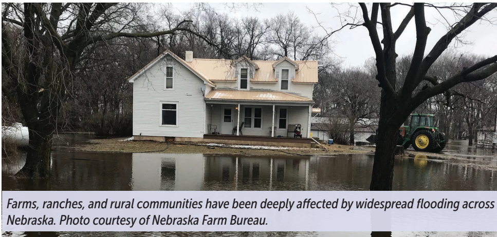
Farms, ranches, and rural communities have been deeply affected by widespread flooding across Nebraska.