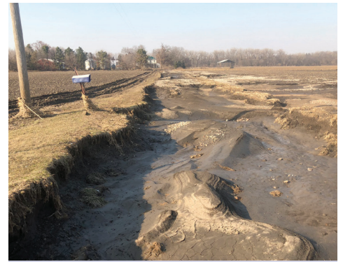
Roads have been washed away in the flood.

For more information on how you can make a difference, visit nefbfoundation.org/ways-to-give/disaster-relief-fund . All donations received will be distributed directly to Nebraska farmers, ranchers, and rural communities in affected areas.