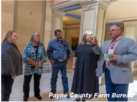
Payne County Farm Bureau

County Farm Bureau Capitol visits were winding down in the final days of May as the 2025 Oklahoma legislative session approached its final day, and Oklahoma Farm Bureau hosted Payne and Pottawatomie County Farm Bureaus for legislative visits with their elected officials the week of May 19.