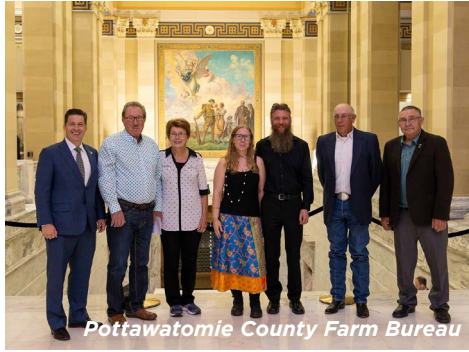
Pottawatomie County Farm Bureau