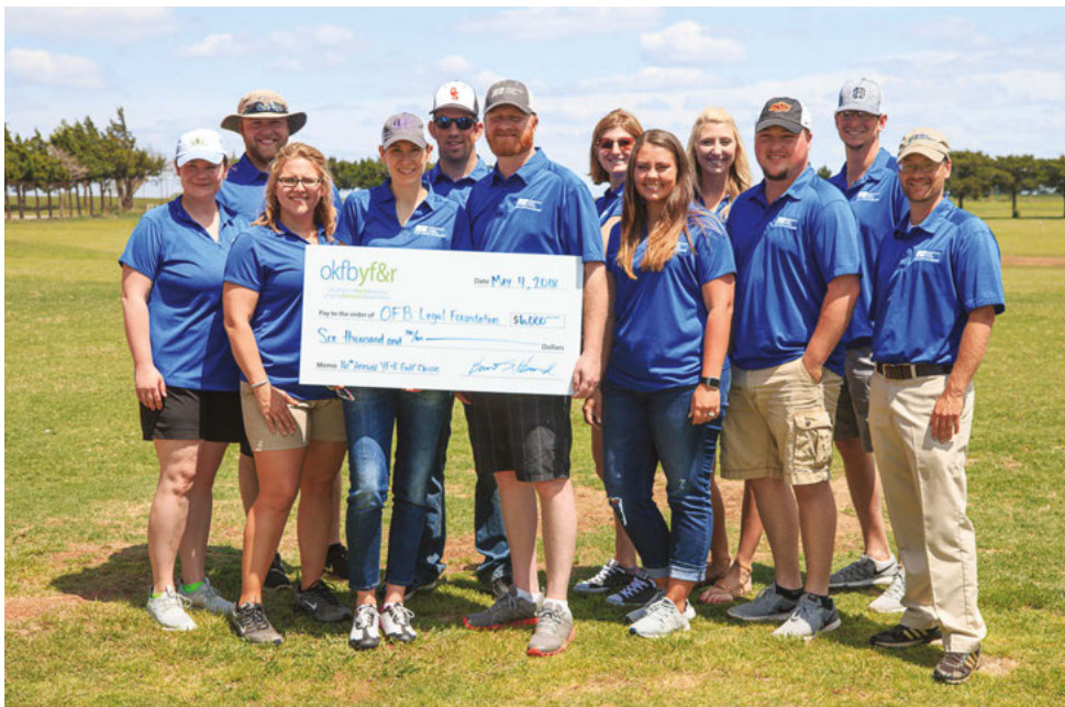
The OKFB YF&R donate more than $6,000 to wildfire relief efforts and the OKFB Legal Foundation following its annual golf tournament held May 4 at the Cedar Valley Golf Club in Guthrie.