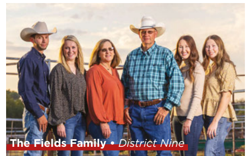
The Fields Family • District Nine