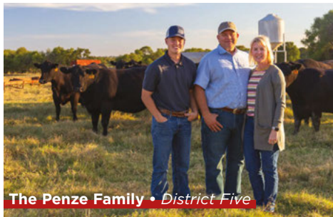
The Penze Family • District Five