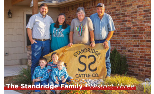
The Standridge Family • District Three