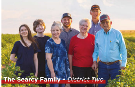
The Searcy Family • District Two