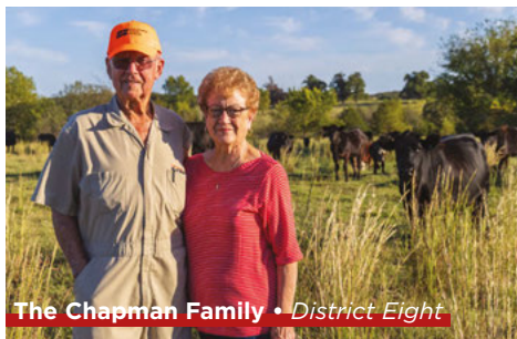
The Chapman Family • District Eight