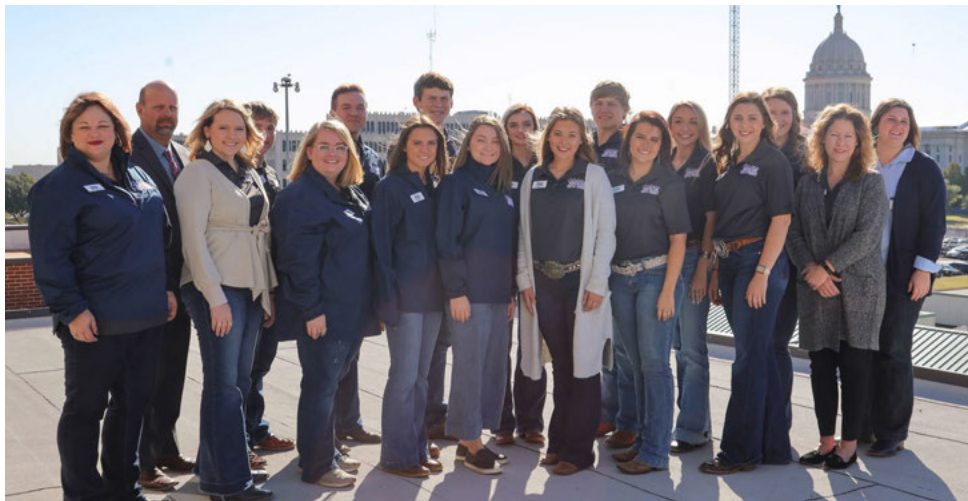
Above: Members of the Oklahoma Department of Agriculture, Food and Forestry's Agriculture Youth Leadership Council met with leaders and staff at Oklahoma Farm Bureau Oct. 17. The young leaders learned about OKFB's work for agriculture and rural Oklahoma.