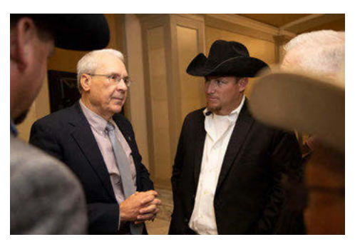
Rep. Rande Worthen took a moment off the floor of the State House to speak with Comanche County members directly and answer questions on upcoming legislation.