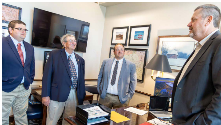
Logan County Farm Bureau members visit with Sen. Grant Green during their county's Capitol visit on Tuesday, March 31.

With an early adjournment in sight, OKFB expects the pace of session to pick up as legislators prepare to head home to their districts early for the 2026 campaign season.