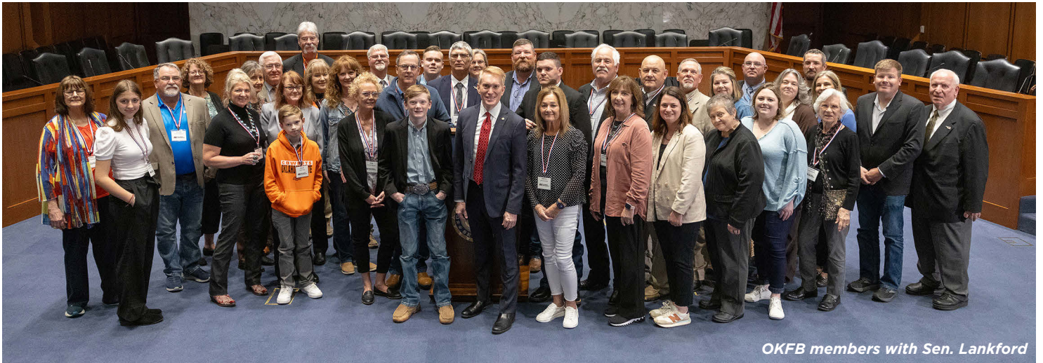
OKFB members with Sen. Lankford