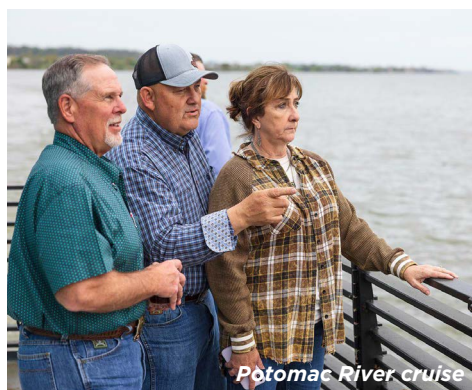
Potomac River cruise