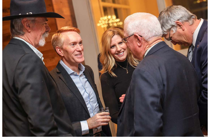
Farm Bureau members visit with Sen. James Lankford at OKFB's second-annual Evening of Impact fundraiser in Oklahoma City, which raised funds for the OKFB Ag PAC.