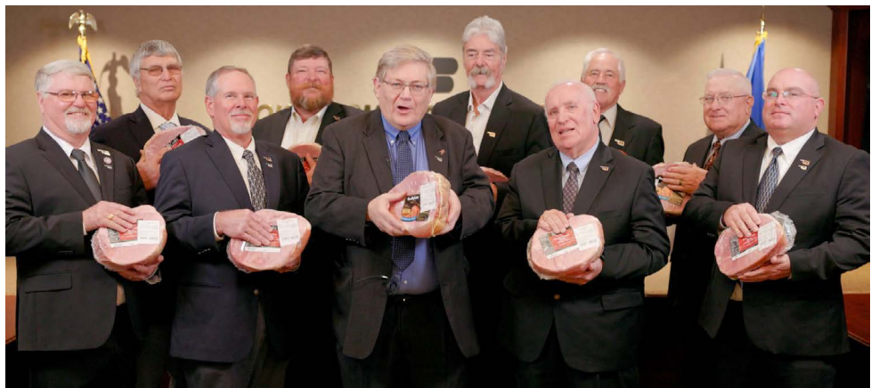
The Oklahoma Farm Bureau board of directors donated 10 hams to the Regional Food Bank of Oklahoma in Oklahoma City as part of the Oklahoma Pork Council’s annual Give a Ham Challenge, which calls upon Oklahomans to donate a ham or make a monetary donation to support Oklahomans facing food insecurity.