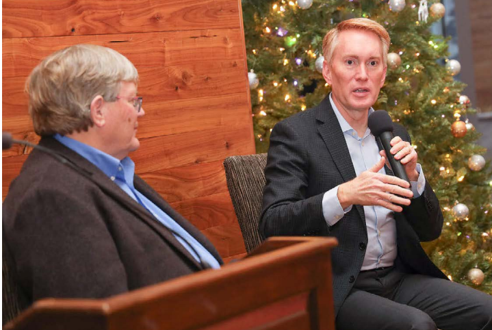
U.S. Sen. James Lankford shared insight from his time serving in Washington, D.C., with Farm Bureau members at OKFB's Evening of Impact in Oklahoma City Friday, Dec. 2.