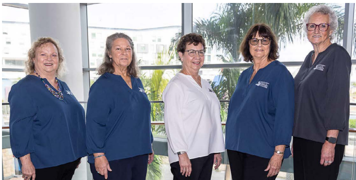
OKFB WLC members participated in the AFBF Women's business session and regional caucus at the 2023 AFBF Convention.

For additional convention news and highlights from AFBF, visit annualconvention.fb.org .