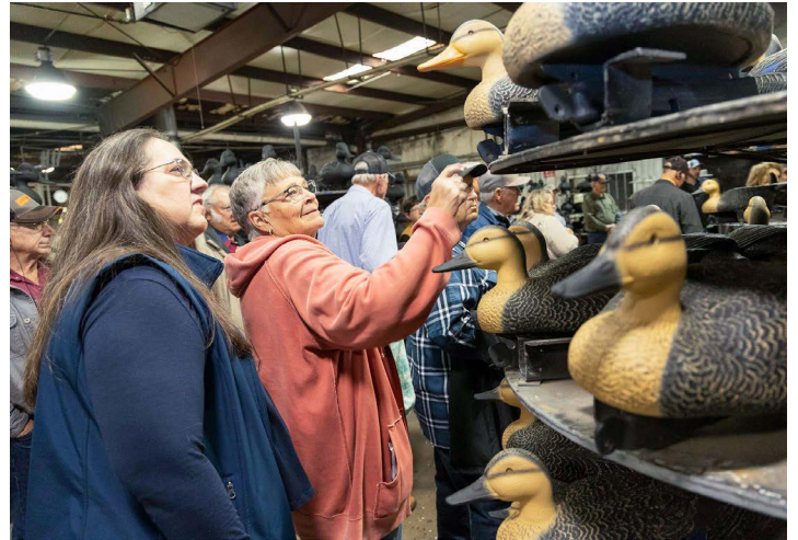
Farm Bureau members toured G&H Decoys in Henryetta during the 2022 Ag Tour. G&H decoys is the oldest decoy manufacturer in the United States.