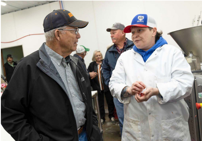
OKFB members visited Watson Farms Meat Processing in Council Hill during the 2022 Ag Tour. Watson Farms is a state-inspected facility that also handles custom meat processing.