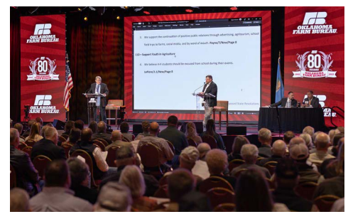
Voting delegates discussed and voted upon policy proposals during Saturday's business sessions.