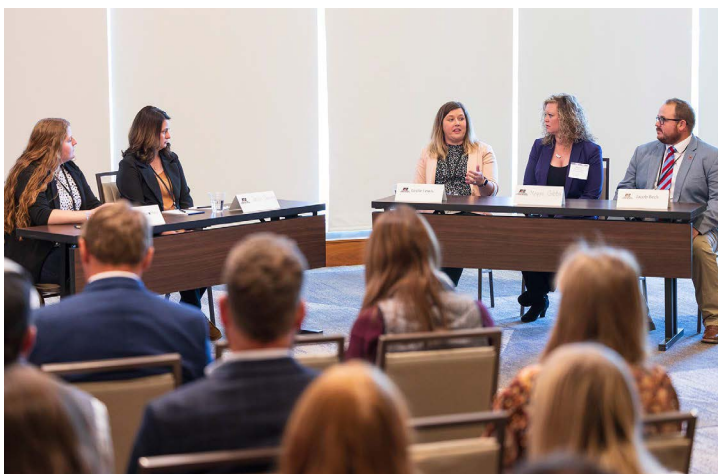
Young Farmers and Ranchers discussion meet competitors participate in the final round of the contest. A total of three discussion meets were held during convention, including contests for high school students and collegiate Farm Bureau members.

2023 Convention Highlights • 2023 Convention Highlights • 2023 Convention Highlights • 2023 Convention Highlights