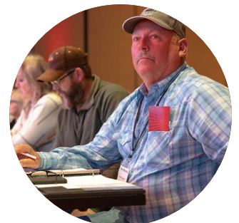
Grassroots policy development