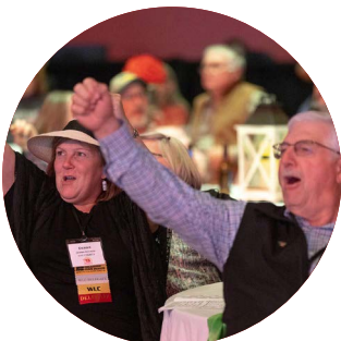
Friday game night

Get ready for OKFB's annual meeting, Nov. 10-12 in OKC!