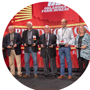
Saturday evening awards