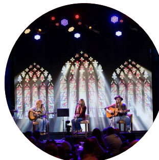
Sunday morning worship