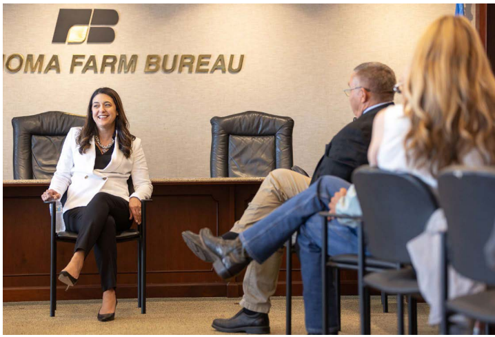
Congresswoman Stephanie Bice (left), who represents Oklahoma's fifth congressional district, visits with Farm Bureau members at the OKFB home office on Tuesday, Aug. 29.