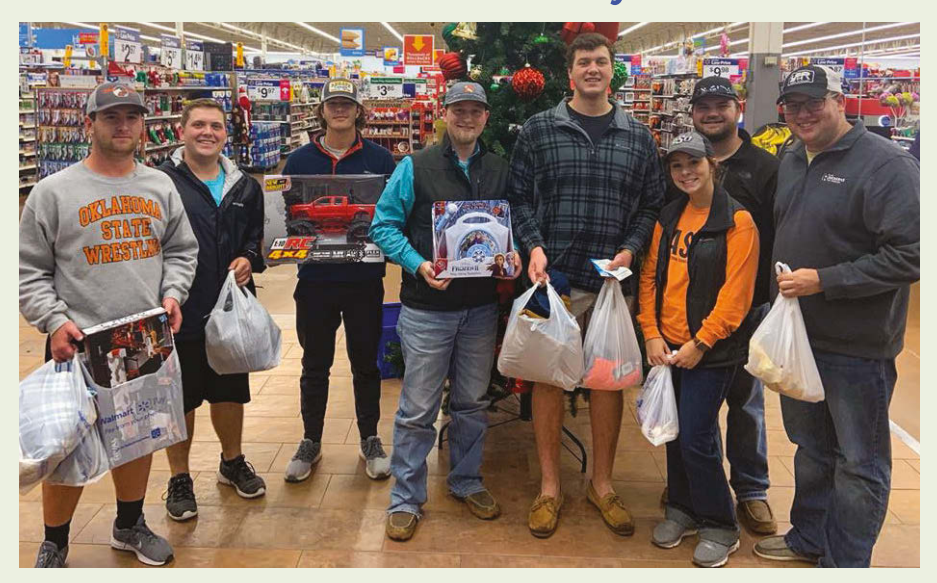
Above: Members of the Oklahoma State University Collegiate Farm Bureau chapter took time to purchase Christmas gifts for three Payne County children through the Salvation Army's Angel Tree Program. OKFB is proud of our collegiate leaders and their willingness to make a difference within Payne County.