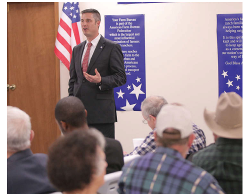
Sen. Chris Kidd shares his optimism for the upcoming regular legislative session with Comanche County Farm Bureau members.