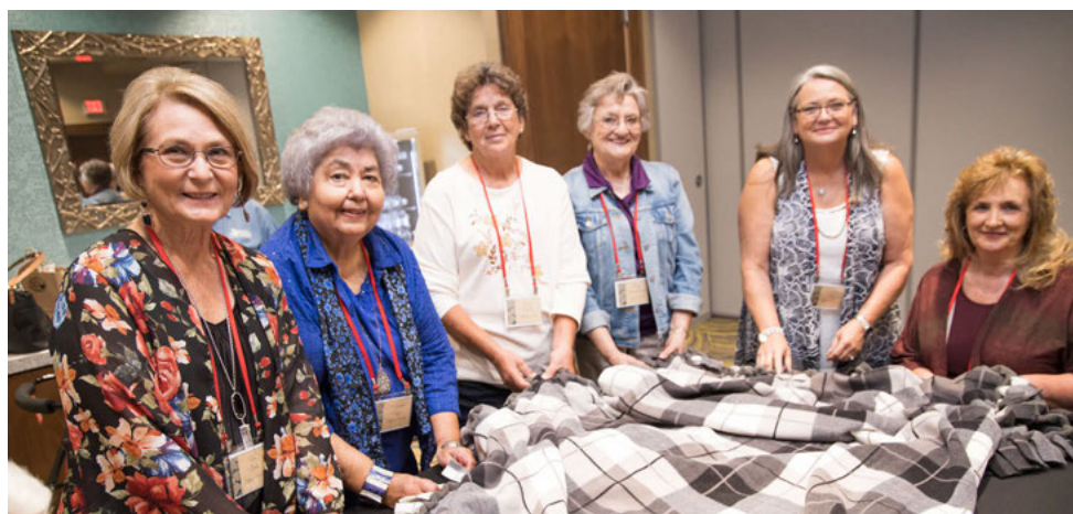
Above: Conference attendees help make blankets to be donated to Ronald McDonald House Charities in Tulsa and Oklahoma City during the 2019 WLC Fall Conference.